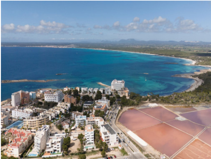
Colonia Sant Jordi