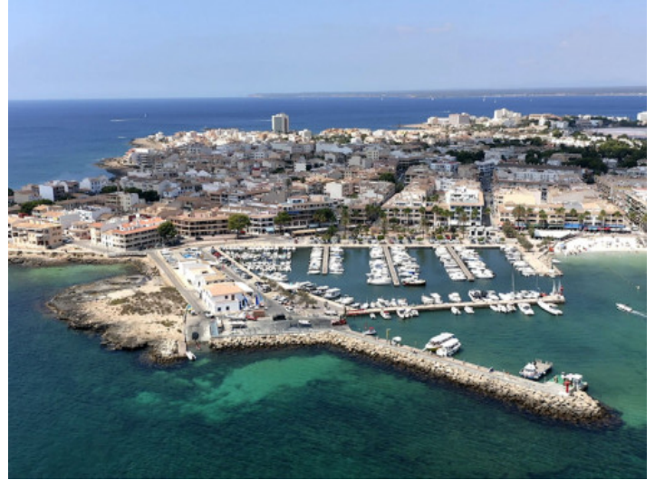
Harbour of Colonia Sant Jordi