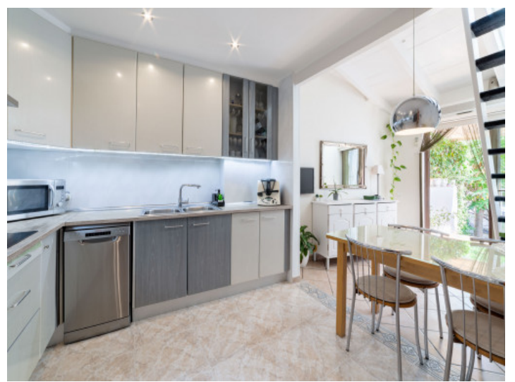
Beautiful kitchen with further terrace Lovely rear terrace All information is correct to the best of our knowledge. Errors and prior sale excepted. This prospectus is purely for information purposes. Only the notarized deed of sale is legally binding.

PORTA MALLORQUINA • C./ CONQUISTADOR 8, 07001 PALMA TEL. +34 971 698 242 • INFO@PORTAMALLORQUINA.COM