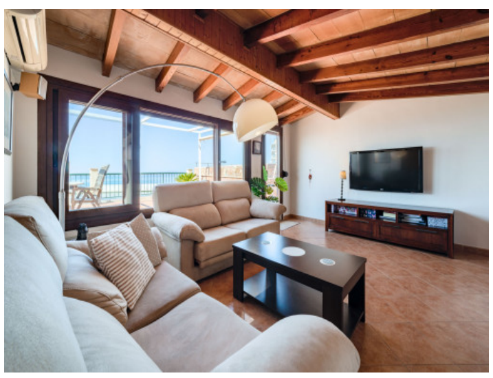
Large living area with terrace access