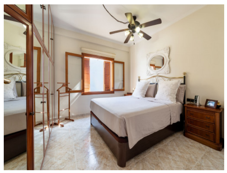
Bright double bedroom