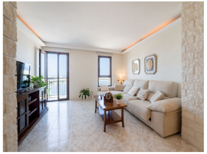
Main living area with sea views