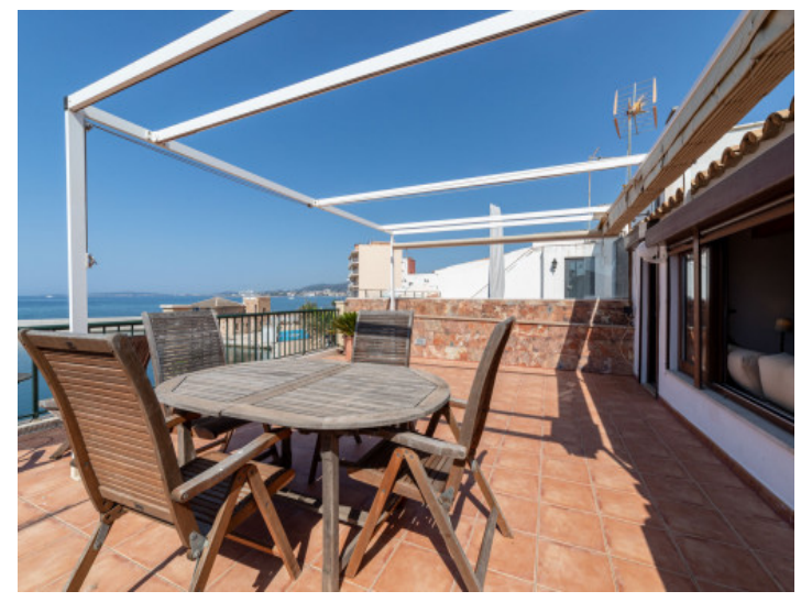
Fantastic sea view terrace