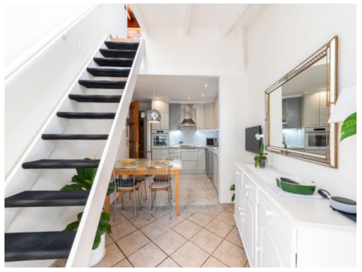
Stairs to the upper floor