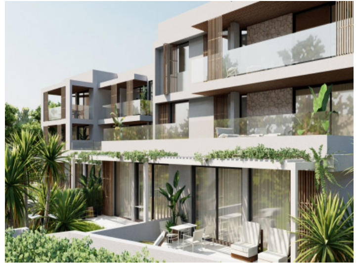
Ground floor apartment