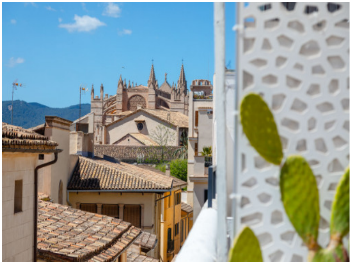
Views to the cathedral