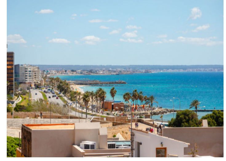
Mediterran sea views