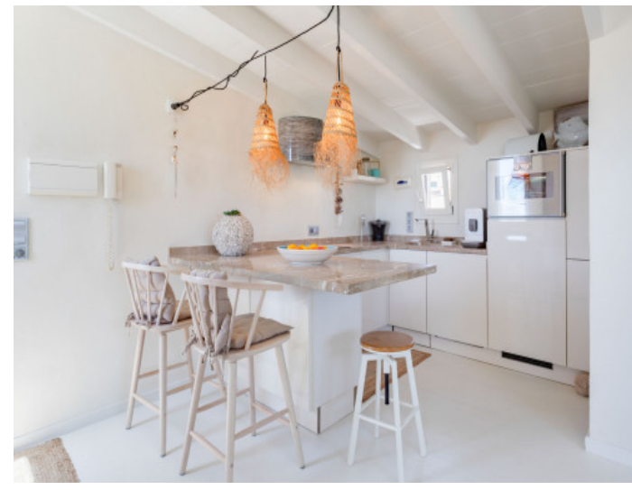
Open kitchen and dining area

PORTA MALLORQUINA® Your home. Our passion.