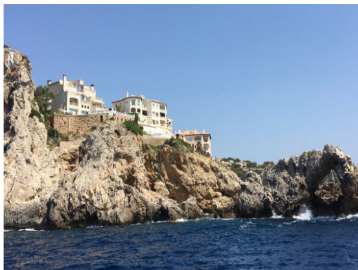
Exterior view from the sea

All information is correct to the best of our knowledge. Errors and prior sale excepted. This prospectus is purely for information purposes. Only the notarized deed of sale is legally binding.