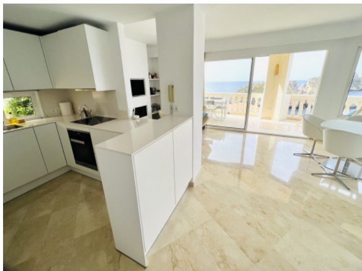
Light-flooded living area with open-plan, modern kitchen