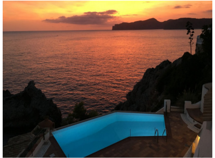
Illuminated communal pool with sea view