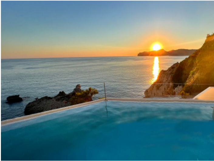
Communal pool with breathtaking views